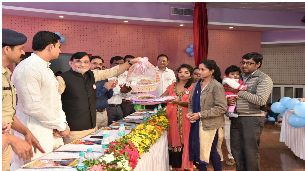
BADHAI KITS DISTRIBUTION