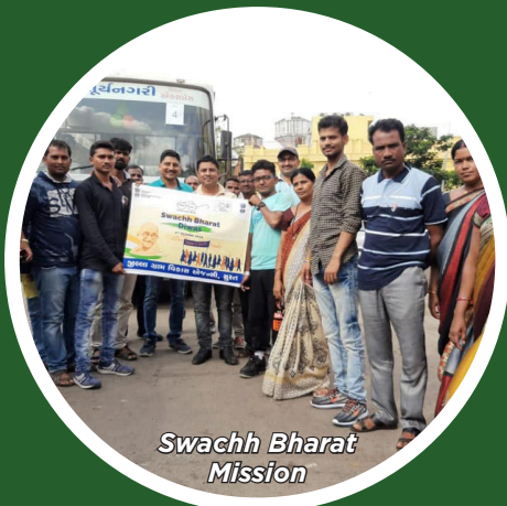
Swachh Bharat Mission

India's per capita CO 2 emissions are 1.8 tonnes, significantly lower than the global average of 4.5 tonnes.