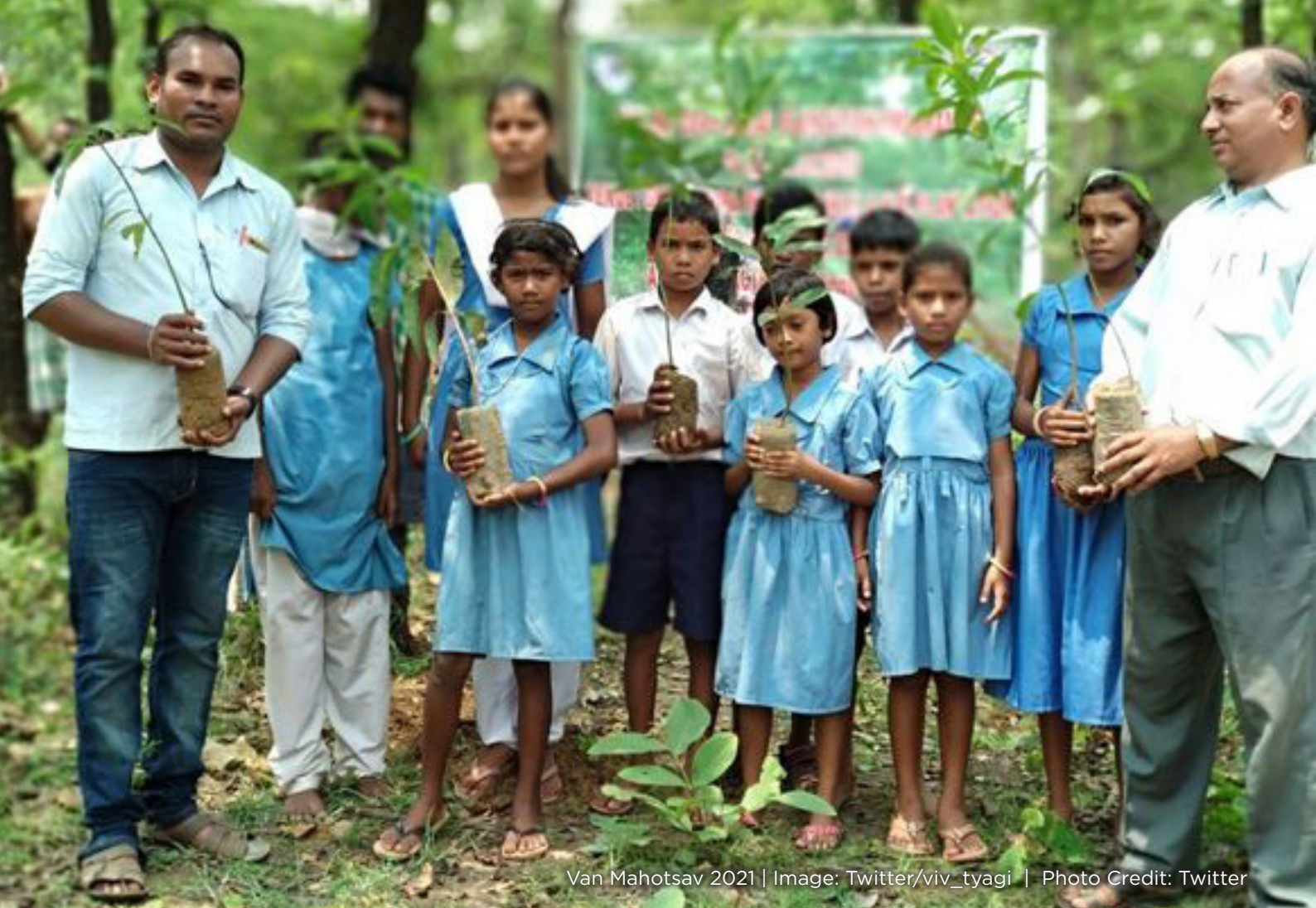
Van Mahotsav 2021 | Image: Twitter/viv_tyagi | Photo Credit: Twitter