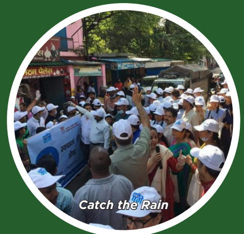
Catch the Rain