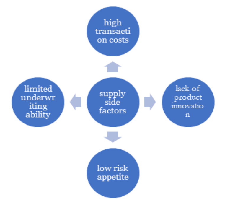
Figure I: Supply Side constraints in traditional brick and mortar banking

Firstly, as IFC research suggests, many of these MSMEs rely on informal money market instruments and money lenders for their debt demand out of preference. This "opting-out" means that the owners never create a credit history with the credit information companies that banks may evaluate the credit risk against. Secondly, even if the MSME owners have a personal loan or other exposure to formal financial markets, their debt profile is "blended" in that it is partly funded in formal and partly in informal money markets. Since the informal debt definitionally is not visible in the credit bureaus, lenders exercise rational apathy towards funding the MSME segment.<sup>11</sup> In other words, the costs of due diligence that a bank will incur towards evaluating the credit risk adjusted against the ticket-size and the yield from the loan make it unviable.